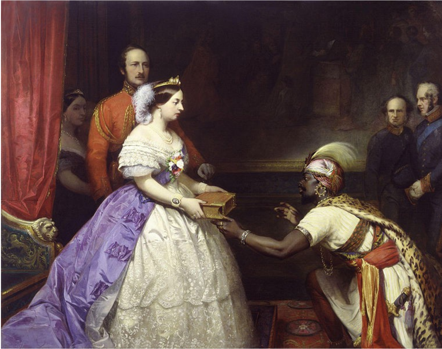
Painting by Thomas Jones Barker