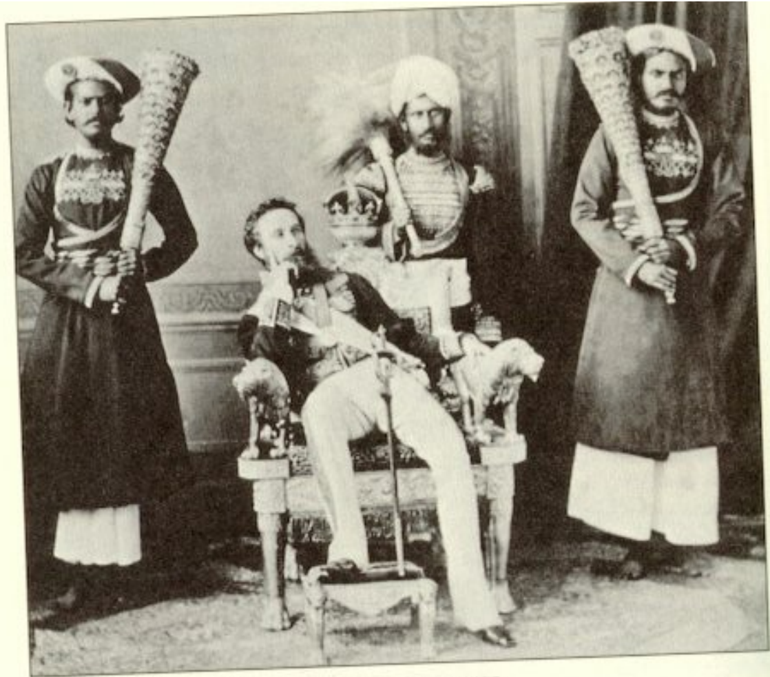
Figure 1.2 The Poet as Viceroy: Lytton in Calcutta, 1877